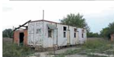
Border sector – “Lekiskure”