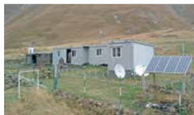
Border sector – “Truso”