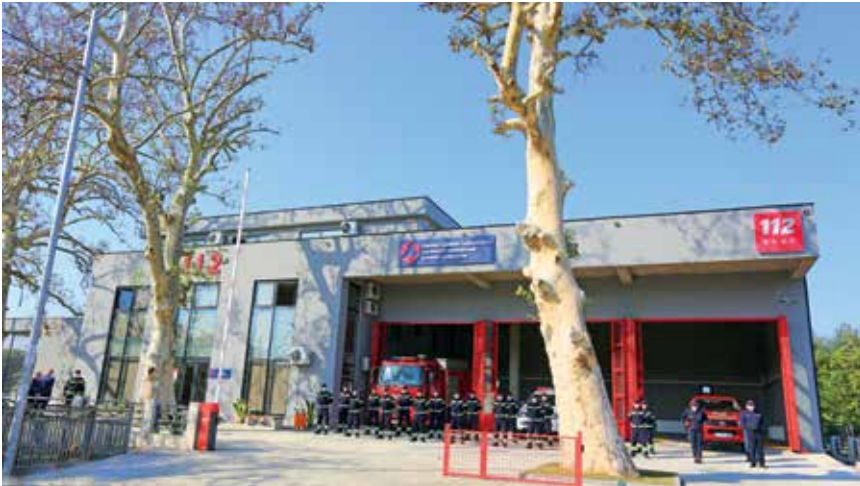
Anaklia Emergency Management Service