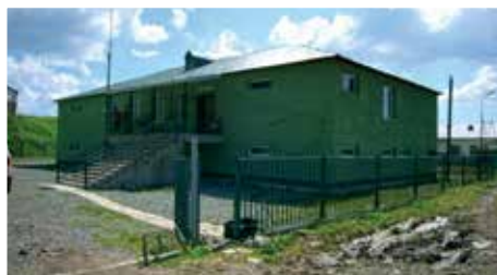
Border sector – “Chirukhi”