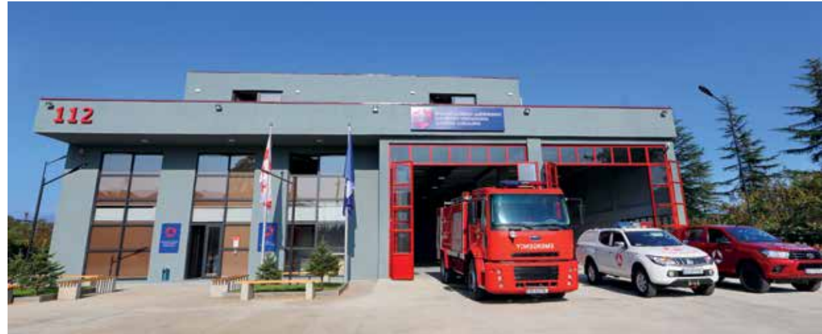
Chkhorotsku Emergency Management Service